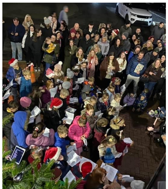
Carols at Hedge End station.

The Grotto raised over £300 which was shared between Heart Start Meon Valley and the Christmas Gift Appeal.