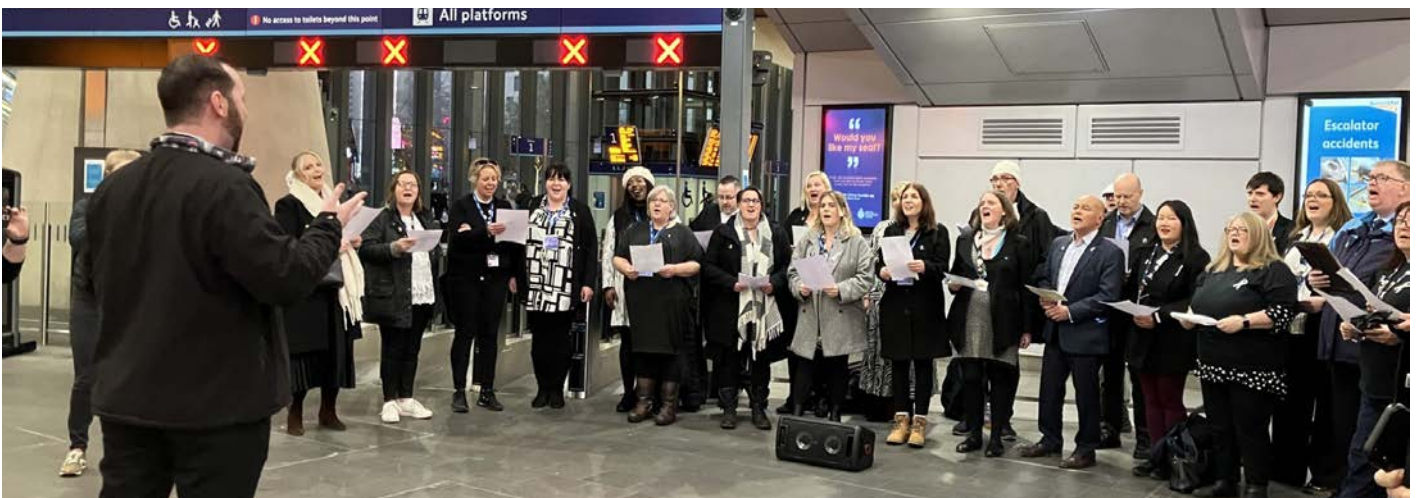
Different Tracks singing at London Bridge station.

The SWR Different Tracks community choir is made up of SWR colleagues, as well as members of community rail groups across the network. They first performed at the Waterloo 175 celebrations in July.