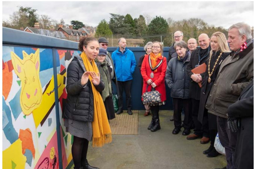
Unveiling of the artwork and new town map in December 2023.