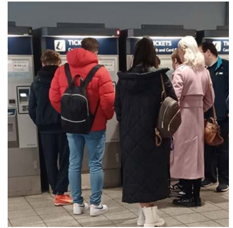
Try the Train group being shown how to use Ticket Vending Machines.

A Try the Train trip followed this in early December, travelling from Southampton to Portsmouth. The group spent the day at the Spinnaker Tower and watching the Royal Navy aircraft carriers in dock. They asked lots of questions about the trains, and were particularly fascinated with the trains themselves, and the train announcements.