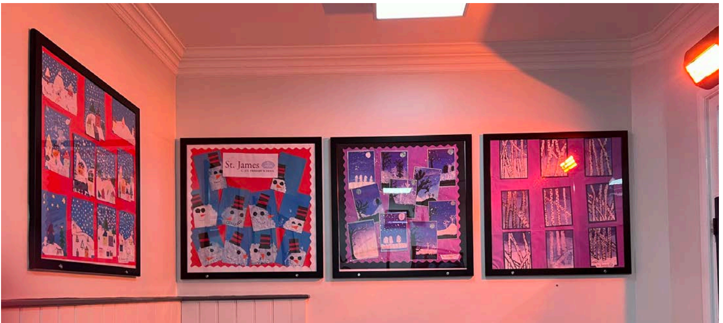
Artwork in the waiting room at Weybridge station.

Some new artwork has been installed at Weybridge station, created by students from the nearby St James Primary School. Sharing pictures via social media, local Weybridge residents have left some nice comments, such as 'what a lovely idea, well done to the children!'