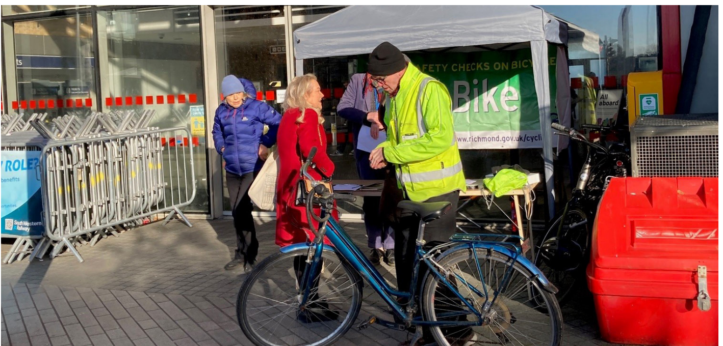
Dr Bike joint security session at Twickenham station.

We are running anti-theft marking events across the network in March. Keep an eye out for more information to come.