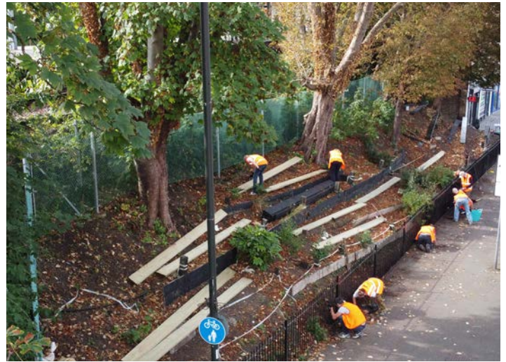
Friends of Raynes Park hard at work.